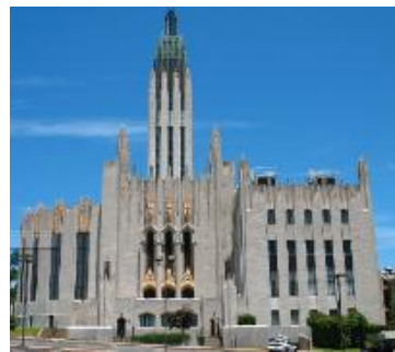
Boston Avenue Methodist Church Tulsa, Oklahoma

The Huffington Post had an interesting article depicting the buildings of arbitrarily selected faith communities across the United States. One structure was selected for each state and reflects the diversity of religion in this, the most religious country in the industrial world. I hope you enjoy this journey, though not specifically related to science and religion, that depict the variety of faiths in our country. You can find the article here .